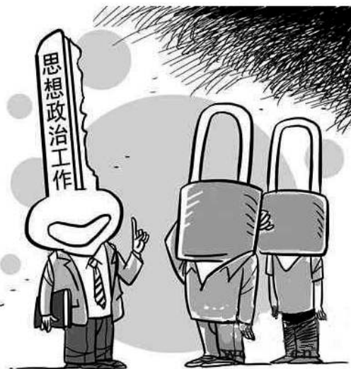
Figure 3 A harmonious society